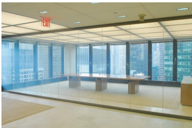
COMMERCIAL: Conference room with space-saving sliding doors.