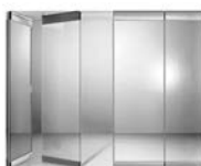
Slide & Stack