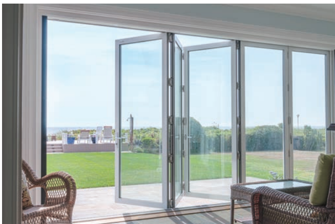
HOSPITALITY & RESIDENTIAL: LC Privacy Glass framing configurations include telescopic, bifold, and accordion openings.