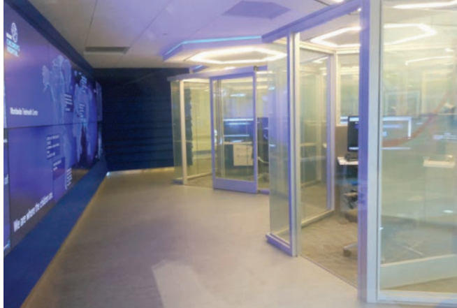
HEALTHCARE: Miami Children's Hospital — Multiple telemedicine hexagonal office pods.