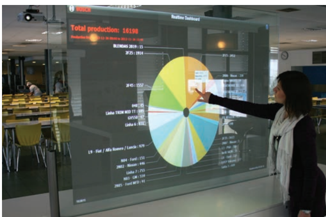
REAR PROJECTION: LC Privacy Glass partitions are an ideal surface for almost any large-format, multimedia, interactive display or presentation.