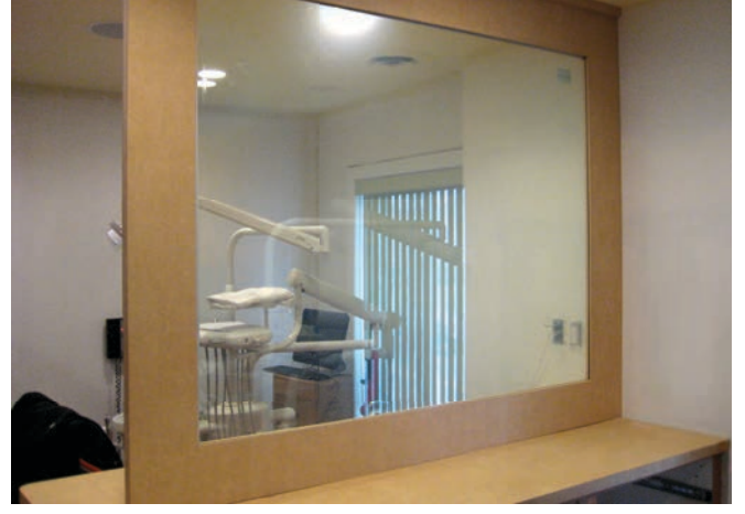
Medical and Dental Offices