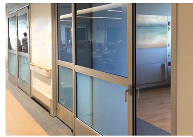
Hospital Patient and Exam Rooms