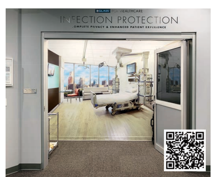
SCAN FOR DEMO