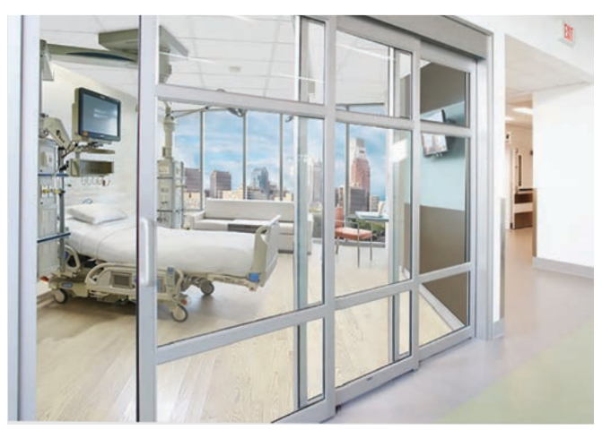
ICUs, ERs, and ORs